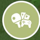
Indoor Game Room