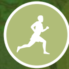
Jogging / Cycling