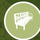
Seating Areas with Pergola