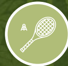
Multi Purpose Sports Court