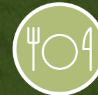
Semi Open Cafe